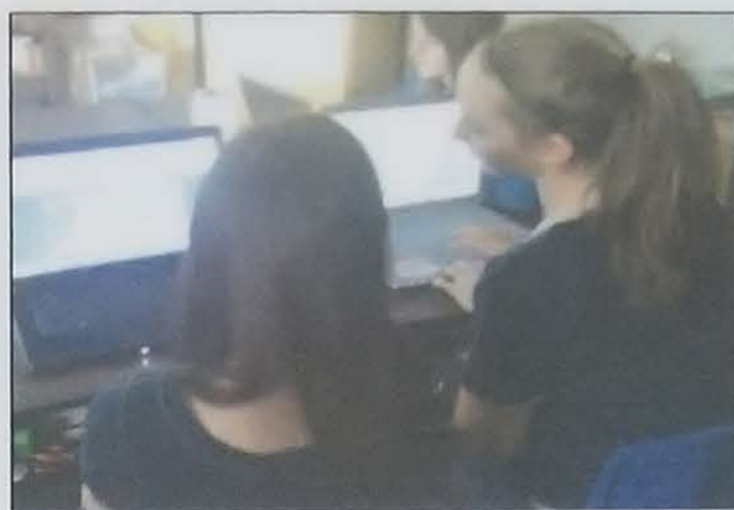
Sixth grade students at World Academy collaborate while researching a project due in their Business and Economics elective course.

Technology classes are taught in a lab setting on Mac computers, where even Kindergarten students practice keyboarding Internet safety and research skills. Beyond the lab itself, technology is omnipresent throughout the school. Computers in the classrooms facilitate lesson plans and "interactive whiteboards" and webcasts are oft-utilized resources. Recently, two classes of students at World Academy skyped with fellow classmates overseas in Rome and China. In Grades Four through Seven the 1:1 laptop program integrates technology across the curriculum. Before and after school options offer homework assistance from teachers, and extra-curricular opportunities include drama, dance, karate and private music lessons. There are even plans in the works to